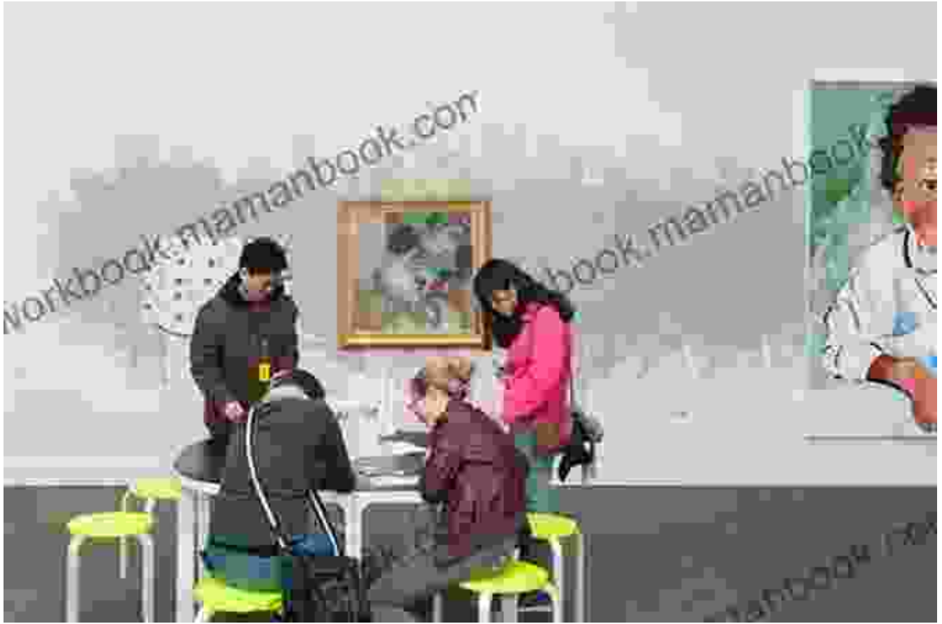
Museum of the Commons in Spokane, Washington