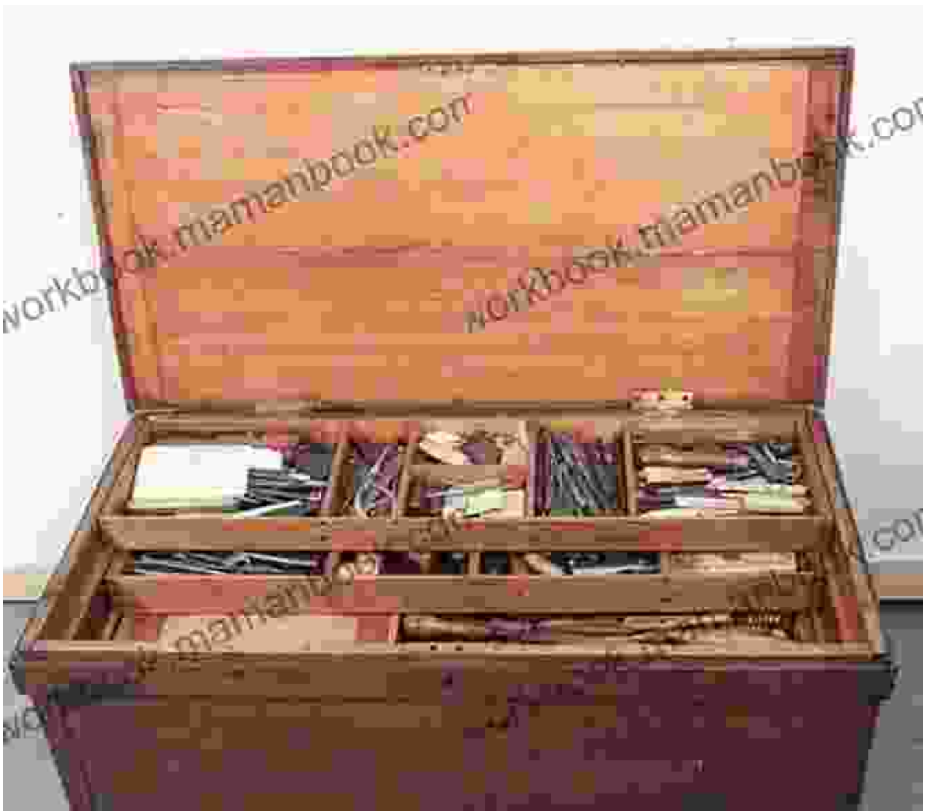
National Museum of Rural Life in Scotland