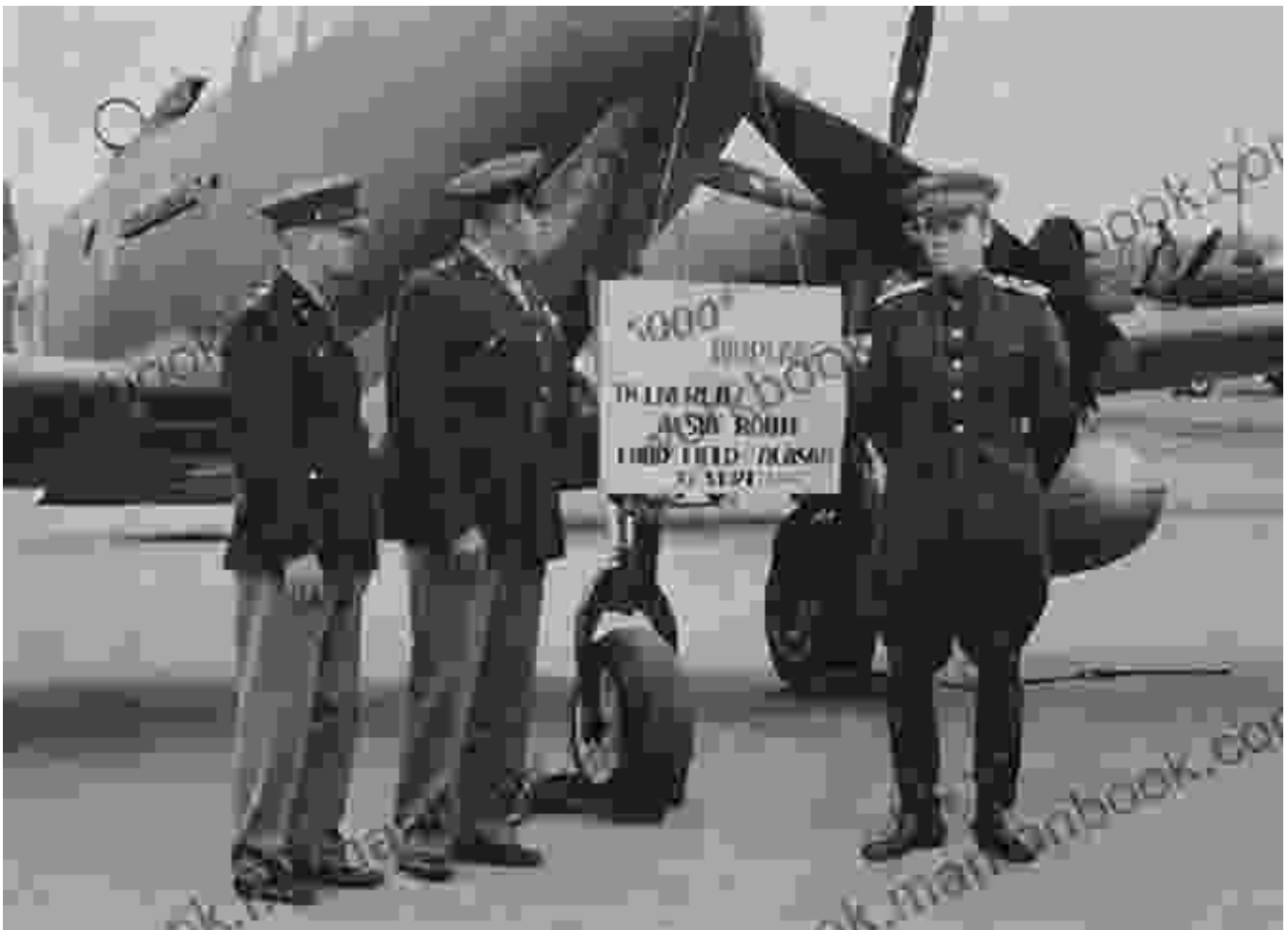
Lend-lease supplies being unloaded from an aircraft at Ladd Field

Despite these challenges, Ladd Field became a vital cog in the lend-lease program, which provided the Soviet Union with over $11 billion worth of supplies and equipment during the war. The airfield served as a central hub for the assembly and dispatch of aircraft, as well as for the delivery of other essential goods, including fuel, ammunition, and medical supplies.